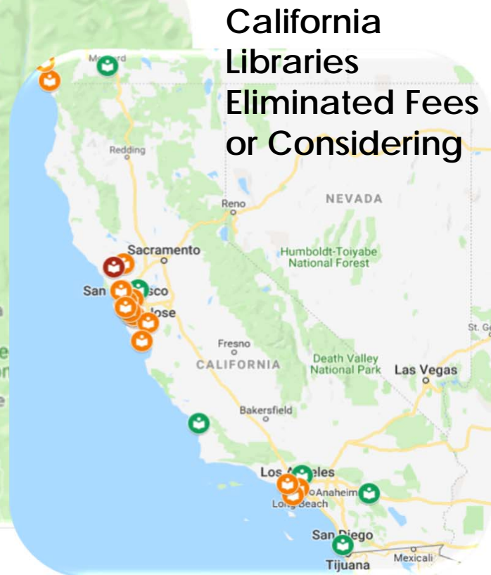
California Libraries Eliminated Fees or Considering